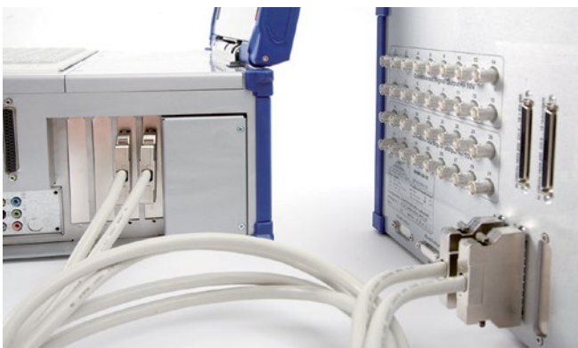
Extra 32 channel signal conditioning to expand a 16 channel instrument to a total of 48 channels