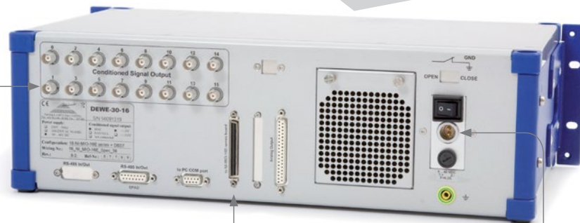
Conditioned signal output \pm 5 V or \pm 10 V