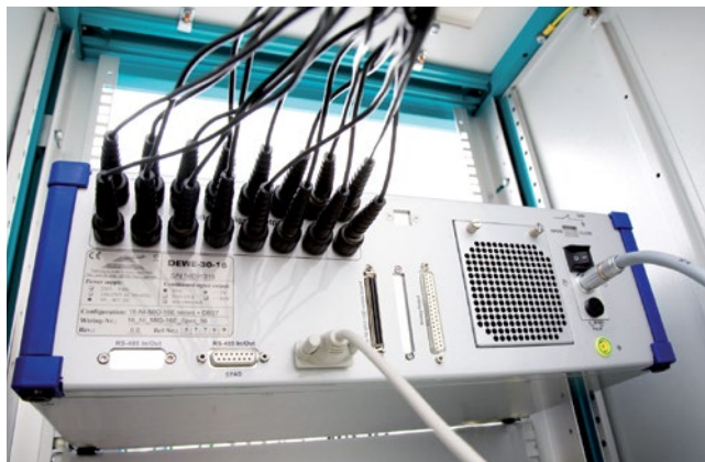
Conditioned signal output \pm 5 V or \pm 10 V to an A/D card, control or SPC