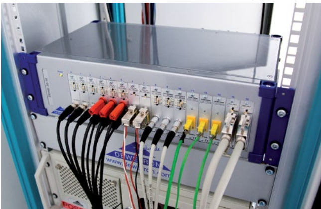
Signal connection to HSI/DAQP modules